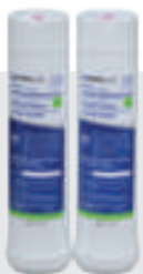
Pre- & Post-Filter NSROPF