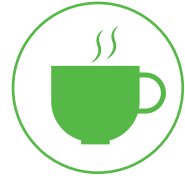
Coffee & Tea