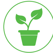
Pets & Plants