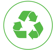
Reducing Plastic Waste