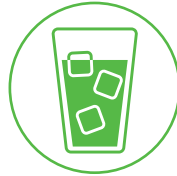
Drinking Water & Ice